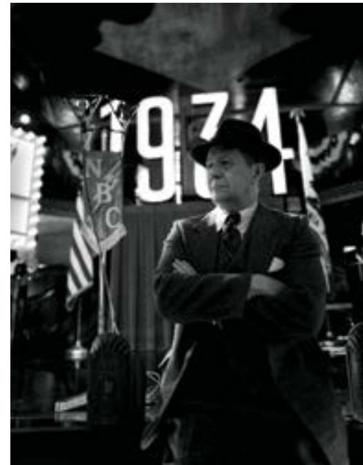
Mank

“EVERYTHING IS FIVE MINUTES AWAY. I LOVE THAT ABOUT PALM SPRINGS.”