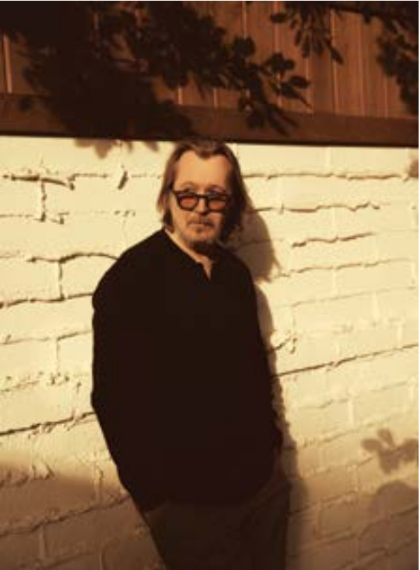
After residing in Los Angeles for more than 30 years, Oldman and his wife relocated to Palm Springs in 2018.